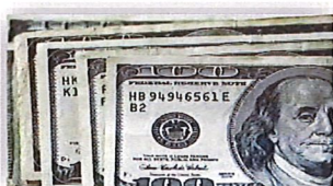
_____ $1000 Cash Money