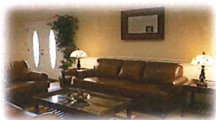
_____ $1000 Shopping Spree at Ken's Furniture

Please mark how many tickets you want for each item in the spaces.