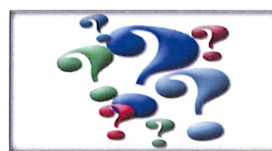
_____ $1000 Mystery Prize to celebrate our buildings 125 th Ann.